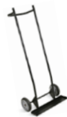
STANDARD CHAIR DOLLY: 24-inch