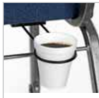
COFFEE CUP HOLDER