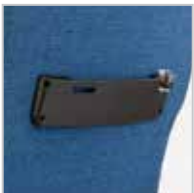
CARD AND CUP HOLDER