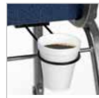
COFFEE CUP HOLDER