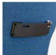
CARD AND CUP HOLDER