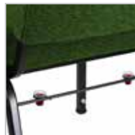
COMMUNION CUP HOLDER