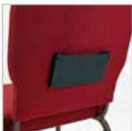
PENCIL AND CARD HOLDER