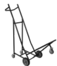
HEAVY-DUTY 5-WHEEL DOLLY