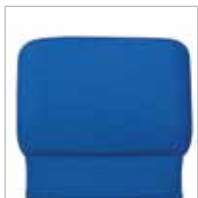
LUMBAR CUTOUT (Standard)