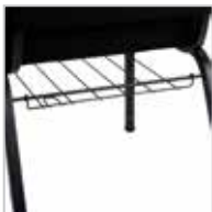
AFTERMARKET BOOK RACK

(See bertolinidirect.com for our large collection of customizable options)