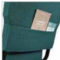
FABRIC CARD HOLDER/POCKET